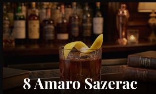
8 Amaro Sazerac