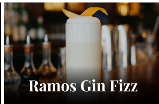
Ramos Gin Fizz