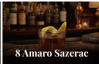
8 Amaro Sazerac