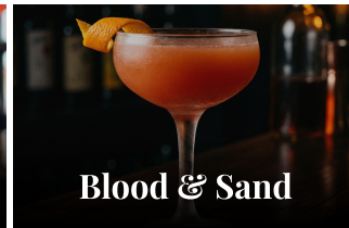
Blood & Sand