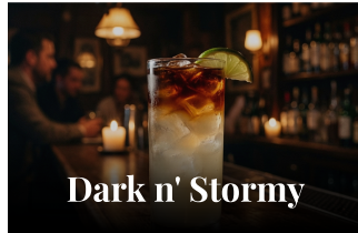
Dark n' Stormy