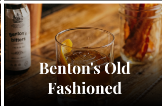
Benton's Old Fashioned