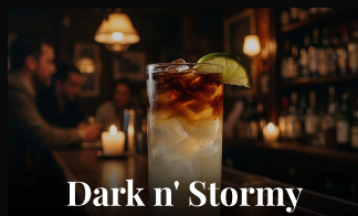
Dark n' Stormy