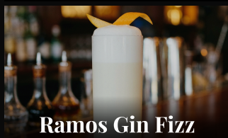
Ramos Gin Fizz