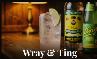
Wray & Ting