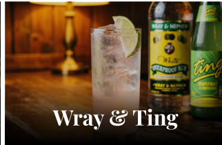
Wray & Ting