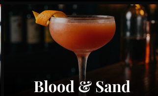
Blood & Sand