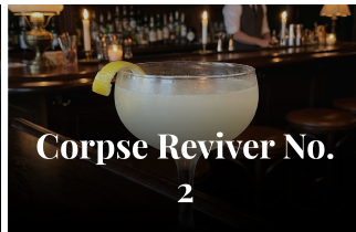
Corpse Reviver No. 2