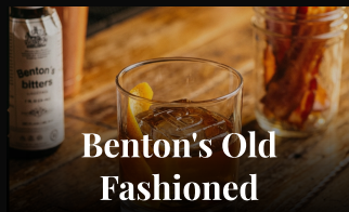
Benton's Old Fashioned