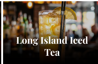
Long Island Iced Tea