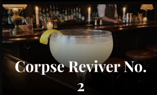
Corpse Reviver No. 2