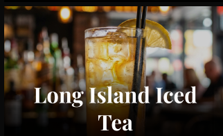
Long Island Iced Tea